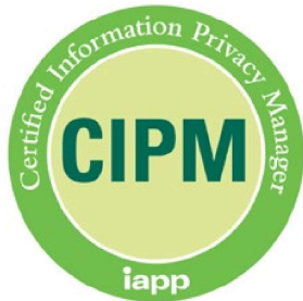
Certified Information Privacy Manager (CIPM)

Our team includes legal experts, cybersecurity specialists, risk professionals and project management consultants. Our privacy experts hold the following certifications: