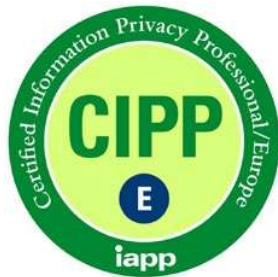
Certified Information Privacy Professional/Europe (CIPP/E)