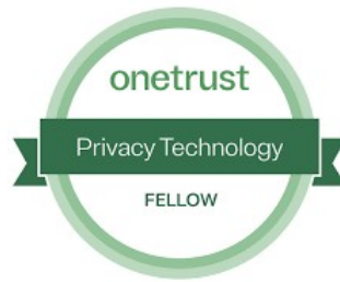
One Trust Certified Fellow of Privacy Technology